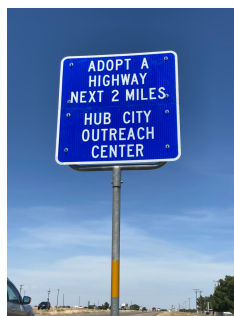
Above: Our commitment to your better tomorrow.

Hub City Outreach Center's eclectic team is comprised of compassionate individuals that each come from diverse backgrounds and vast areas of expertise. Our organization applies a holistic approach on prevention efforts. We treat everyone equally while respecting the unique qualities they possess. Together, we aim to help youth understand their own personal value and guide them towards a bright and successful future through Prevention Services. As a non-profit, we depend on donations. We are always accepting youth/young adult clothes, shoes, linens, hygiene products, school supplies, incentives, and monetary donations. If you would like to collaborate in any way, please reach out via email. Thank you for considering us!